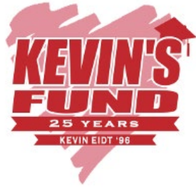
2021-2022 Norwalk High School Marching Band Shirt Patch